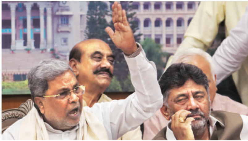
Karnataka Chief Minister Siddaramaiah (left) with his deputy D K Shivakumar at a press conference in Bengaluru on Tuesday. The CM accused the Centre of indulging in vendetta politics against Opposition-ruled states

In May 2023, the Congress central leadership mediated between him and Shivakumar before he took the oath of office. The CM had challenged the sanction granted by Governor Gehlot for an investigation against him in the alleged